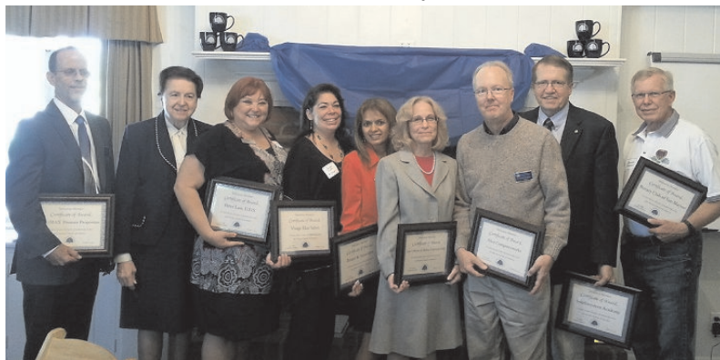
2014 Milestone Members