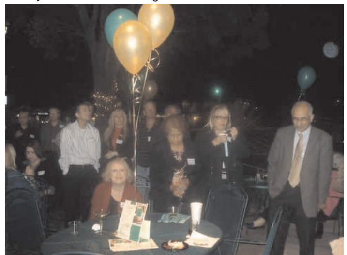
An eager crowd awaits the Raffle!