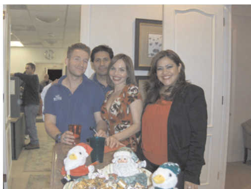
The Staff at San Marino Security Systems was ready for the holiday festivities.