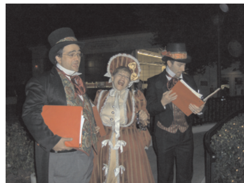
Carolers entertained the Crowd.