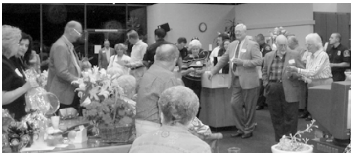
Quite a crowd gathered for the September Mixer at Citizens Business Bank.