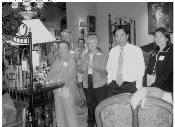
Attendees admired the beautiful furnishings at Henredon.