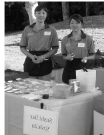
Sushi Bar Yoshida's table was a popular site during the mixer.