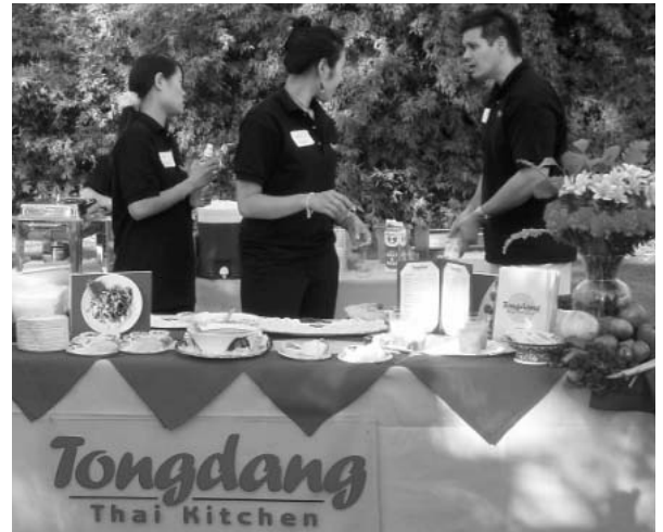
San Marino's newest restaurant is a first time participant in the June Community Mixer.