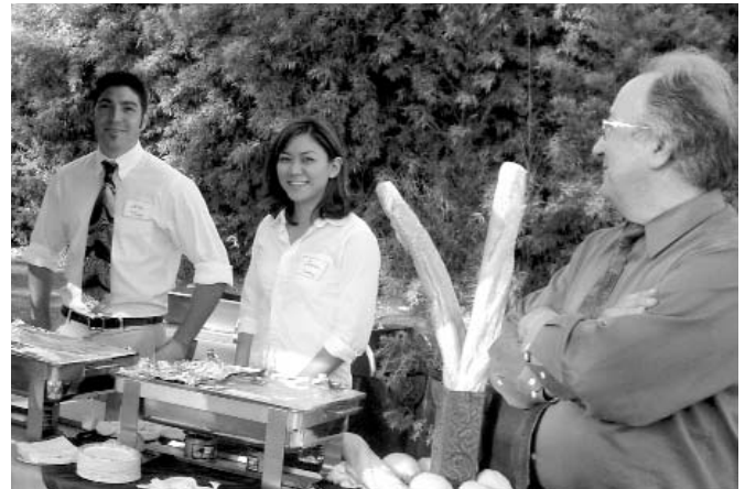
Twohey's is ready for business.