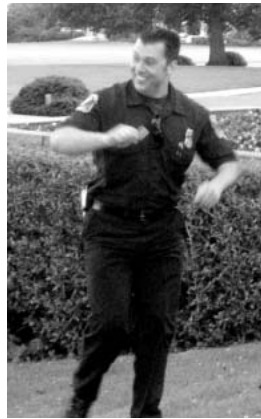
This fireman was so happy when his number was announced he danced a jig.